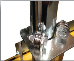
Sealed Steel Roller Bearings