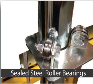
Sealed Steel Roller Bearings