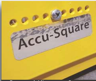
Patented Alignment System