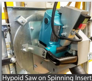
Hypoid Saw on Spinning Insert