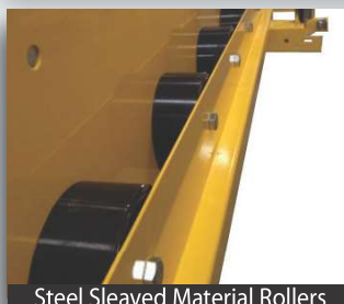
Steel Sleeved Material Rollers